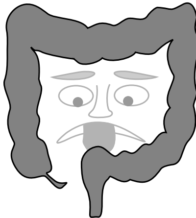
An Irritable Bowel

Be sure that we've discussed this issue with you to your satisfaction. The hallmarks of irritable bowel syndrome are crampy abdominal pains, gas (either belching or lower abdominal gas), abdominal bloating, and constipation or diarrhea or both (constipation alternating with diarrhea). Pains from a stomach or duodenal ulcer are more apt to be burning, up high in your abdomen (just under the breastbone), and to awaken you at night. Cancer only occasionally causes pain and is primarily a problem in people over 50. Dozens of other illnesses can cause abdominal pain; the list is too extensive to cover here.